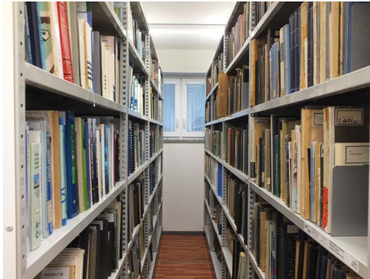
Picture 3. Storage of books