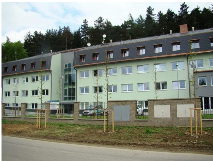
Picture 1. Main Building of the USB FFPW in Vodňany

Library was damaged during flood in 2002 when 1500 library items were destroyed. After restructure, the Library of Research Institute of Fish Culture and Hydrobiology since 1 st January 2012 has become a branch library of the University of South Bohemia named Library of Faculty of Fisheries & Protection of Waters. Since summer 2013, the Library has been located in the newly renovated building of the Faculty of Fisheries and Protection of Waters (FFPW) in Vodňany, which was renewed thanks to the project CENAKVA .