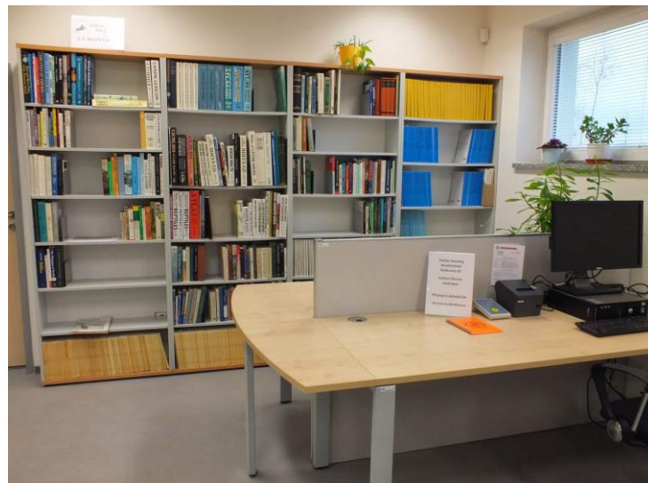
Picture 2. E. K. Balon Library

The Library is member of International Association of Aquatic and Marine Science Libraries and Information Centers (IAMSLIC) and European Association of Aquatic and Marine Science Libraries and Information Centers (EURASLIC) since 2014.