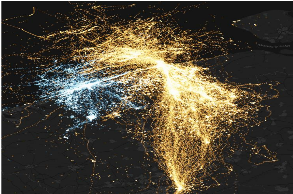
Fig. 1. Visualization Gull tracking data

The quality of the data is assessed using several tools, such as Open Refine and QGIS, and issues and tasks regarding the data and metadata are publicly recorded on Github (e.g. https://github.com/LifeWatchINBO/vis-inland-occurrences/issues ), which allows external users to see current issues and submit their own. Once most issues are resolved, the metadata are imported to the INBO production IPT ( http://data.inbo.be/ipt/ ) and a Darwin Core archive is created, published and registered.