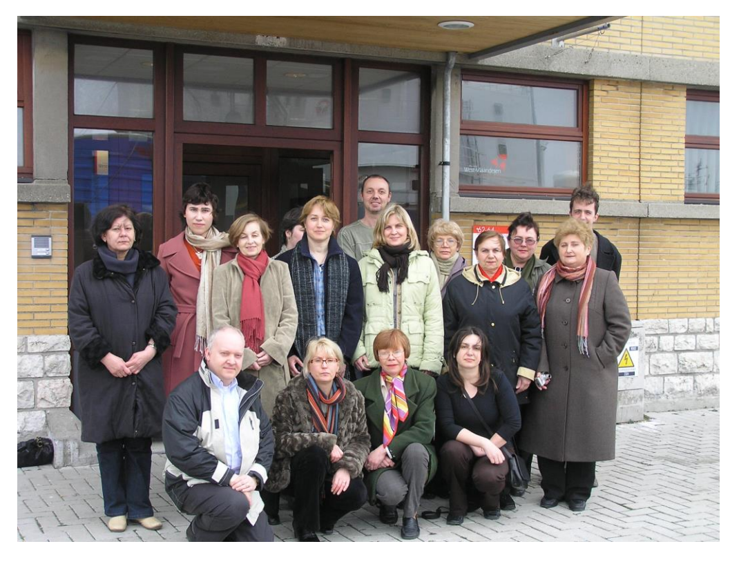
Participants of the first ODINECET MIM Training in 2006 in Oostende, Belgium

This courses helped us start many projects, such as establishing digital repositories (IBSS and CEEMaR).