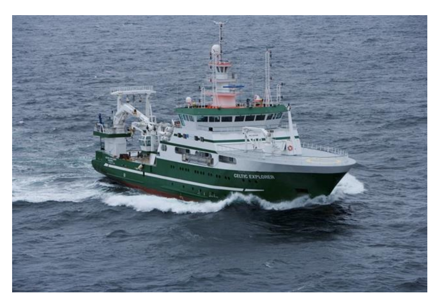
RV Celtic Explorer.

The Marine Institute also holds a unique catchment research facility at Newport, Co. Mayo. This include a laboratory, administration block, freshwater hatchery, fish rearing facilities, fish census trapping stations, a salmonid angling fishery and a comprehensively monitored freshwater lake and river catchment.