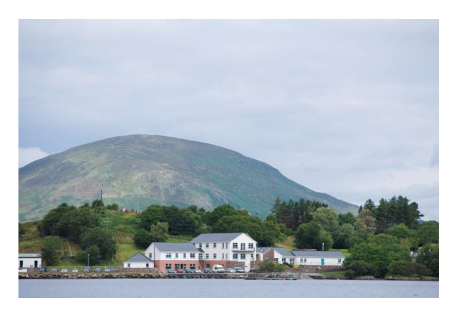
Newport Catchment Facility, Newport, Co. Mayo, Ireland.

The Marine Institute also holds a unique catchment research facility at Newport, Co. Mayo. This include a laboratory, administration block, freshwater hatchery, fish rearing facilities, fish census trapping stations, a salmonid angling fishery and a comprehensively monitored freshwater lake and river catchment.