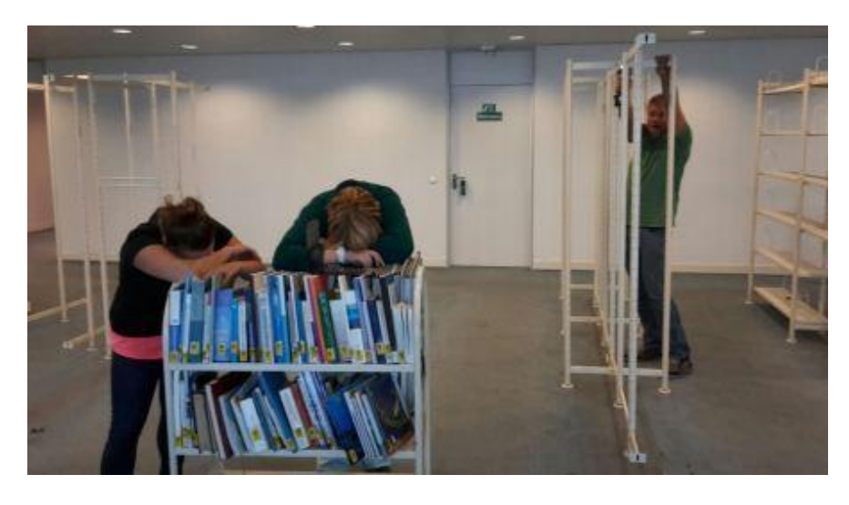
We had to move all our books to the archive and tear down our shelves...