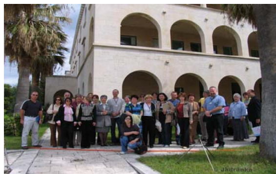
Institute of Oceanography and Fisheries, Split