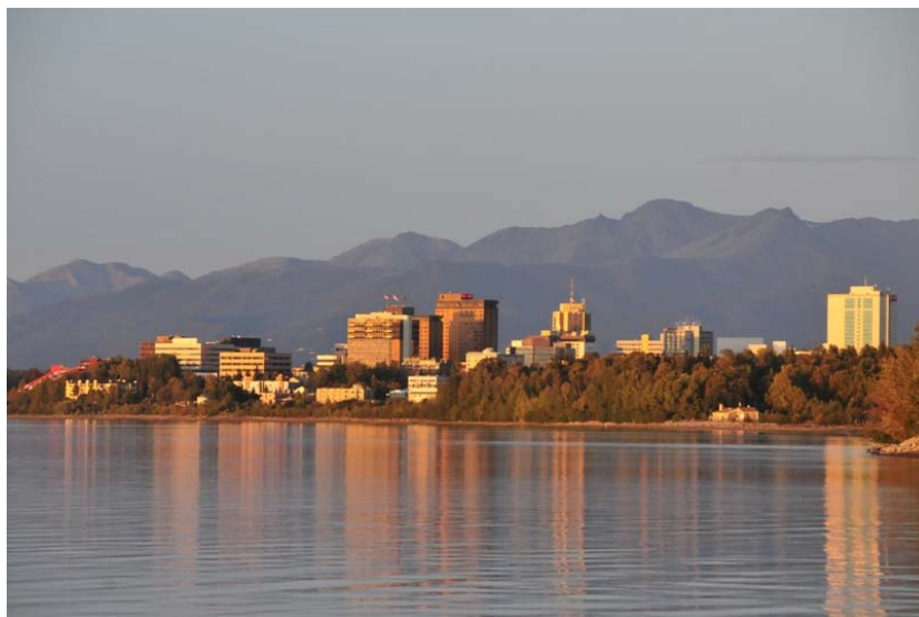
Anchorage skyline.

38th IAMS LIC Annual Conference, August 26-30, 2012 & 24th Cyamus Annual Meeting, August 24-25, 2012 Anchorage, Alaska, USA