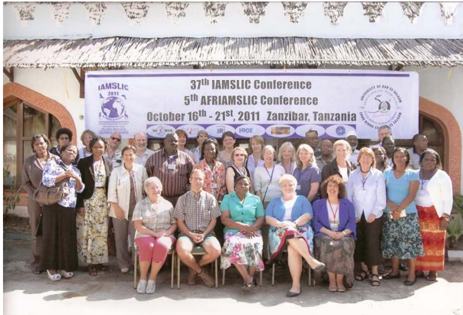
Some sunshine, and sunny smiles, from the friends at the IAMS LIC meeting in Zanzibar!

The last IAMS LIC conference took place in Zanzibar in Tanzania, 16-21 October, 2011. It was the first IAMS LIC meeting in Africa. It gathered around 40 persons. Zanzibar is a semi-autonomous part of Tanzania in East Africa. It is situated in the Indian Ocean, 25–50 kilometres off the coast of the mainland. Zanzibar's ecology is of note for being the home of the endemic Zanzibar Red Colobus Monkey and the island is well known for spices.