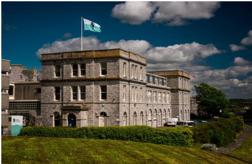
The Marine Biological Association, Citadel Hill, Plymouth UK

As with many libraries, the NMBL is moving from a print to a digital world and changes to the collection and use of space are constant. However researchers access our knowledge and information, whether by using our archive and historic print collections, or by accessing our digital collections to study and publish cutting edge marine research, the NMBL will remain at the centre of this vibrant community for many years to come.