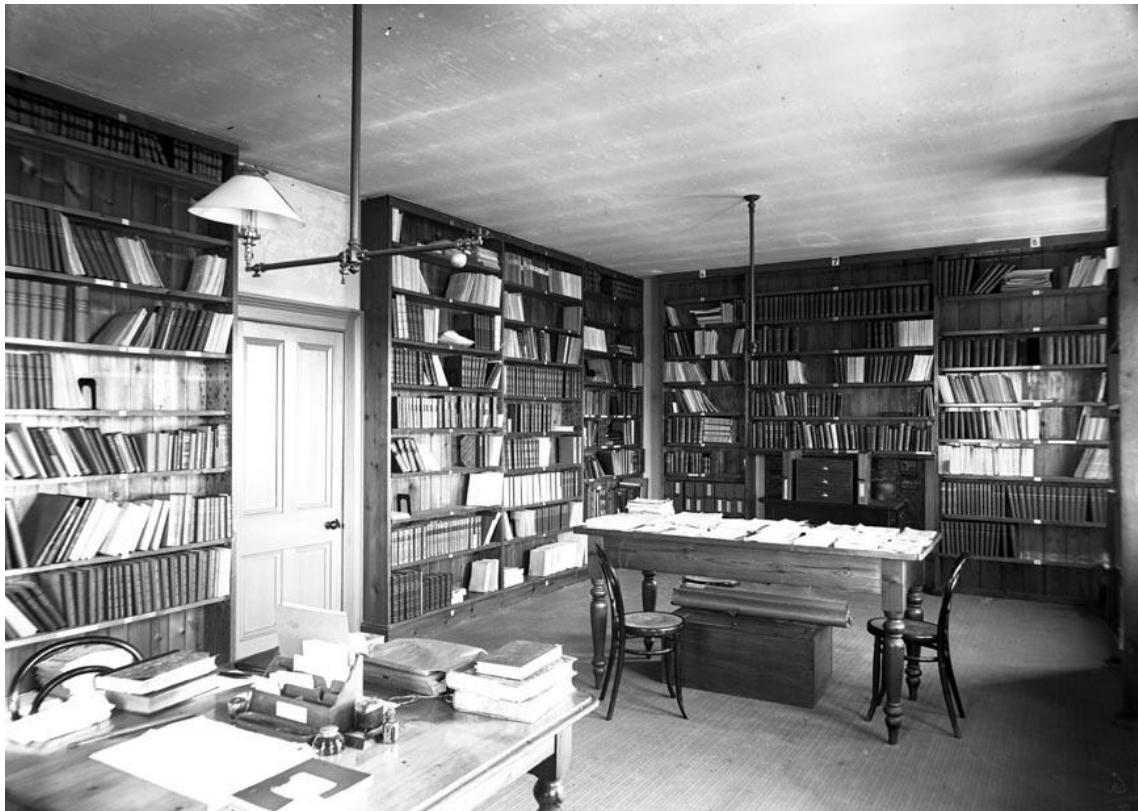
The original library, September 1897

Initially the MBA's library was located on the top floor of the original building and this was the case until 1931. As the need for more shelf space increased, it was decided that the library could no longer stay in its current location.